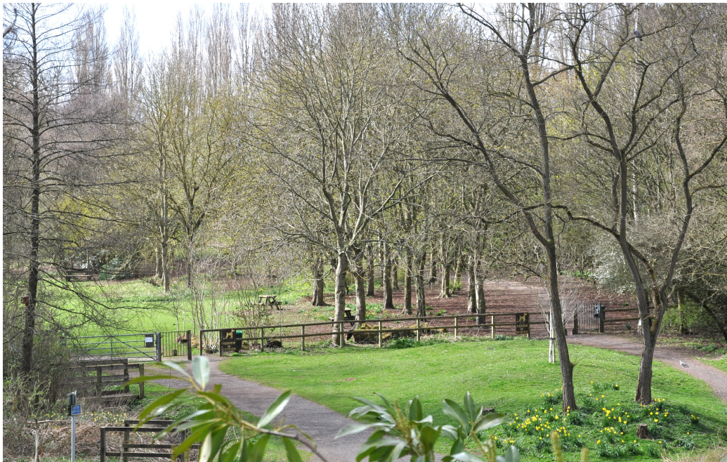
The HS2 line crosses Culcheth Linear Park here

Culcheth Linear Park is a well established greenspace, converted from a disused railway line. It is a mainly wooded walk approximately 2.5km long. The main access point is alongside a bridge, where Wigshaw Lane crosses the park. The proposed route crosses Wigshaw Lane at the same point at a very acute angle, via a new bridge which of necessity will be considerably larger than that existing. The line will be in a cutting at this point and will be considerably wider than the linear park.