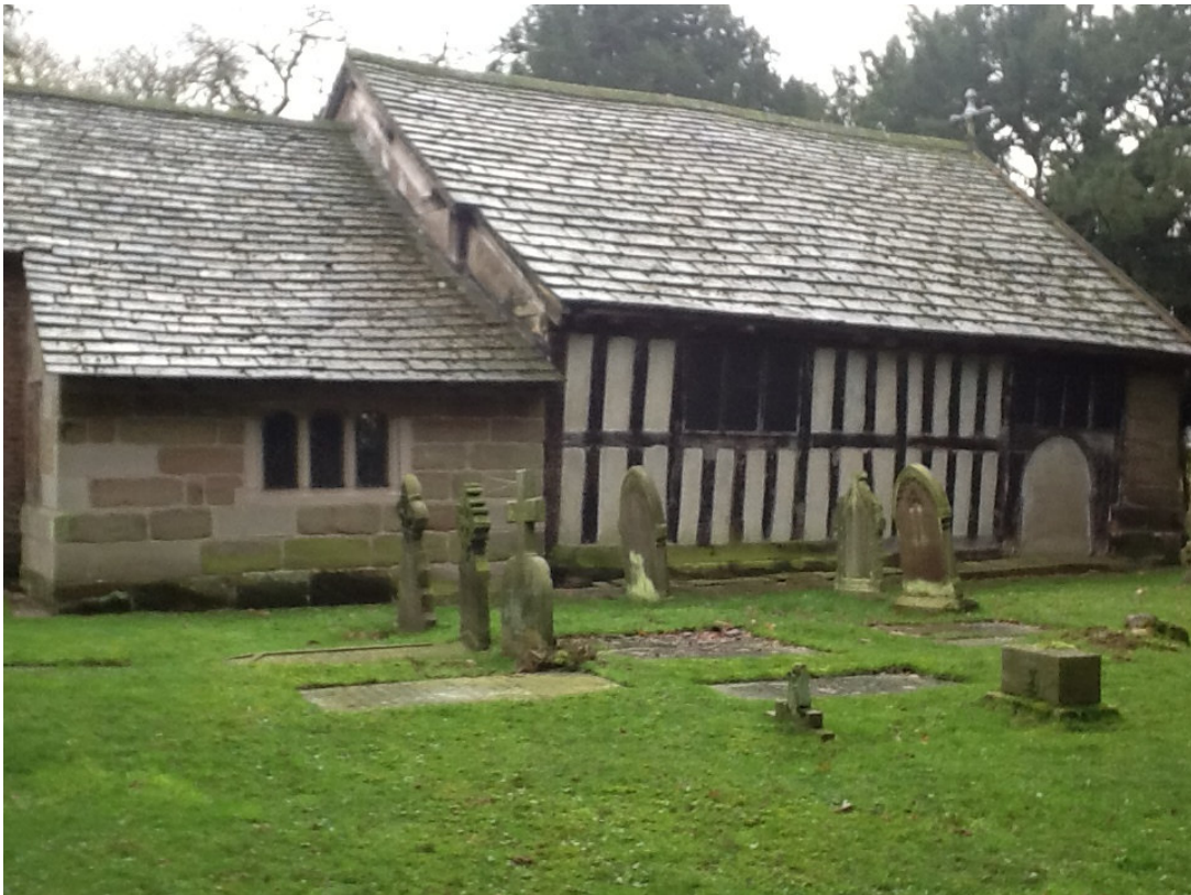
St Werburgh's Medieval Church, Warburton

The response from the Churches Conservation Trust highlights the impact of noise and vibration on the medieval church at Warburton, commenting that “Our medieval church in the village of Warburton is a jewel in our North West collection that we market to visitors as a ‘hidden gem’. Clearly the environmental impact of the proposed HS2 viaduct, in terms of noise and vibration will certainly compromise how our visitors experience this church and its environs, and disrupt the medieval music performed during heritage open days.” They also express concern over the impact of vibration on the church fabric.